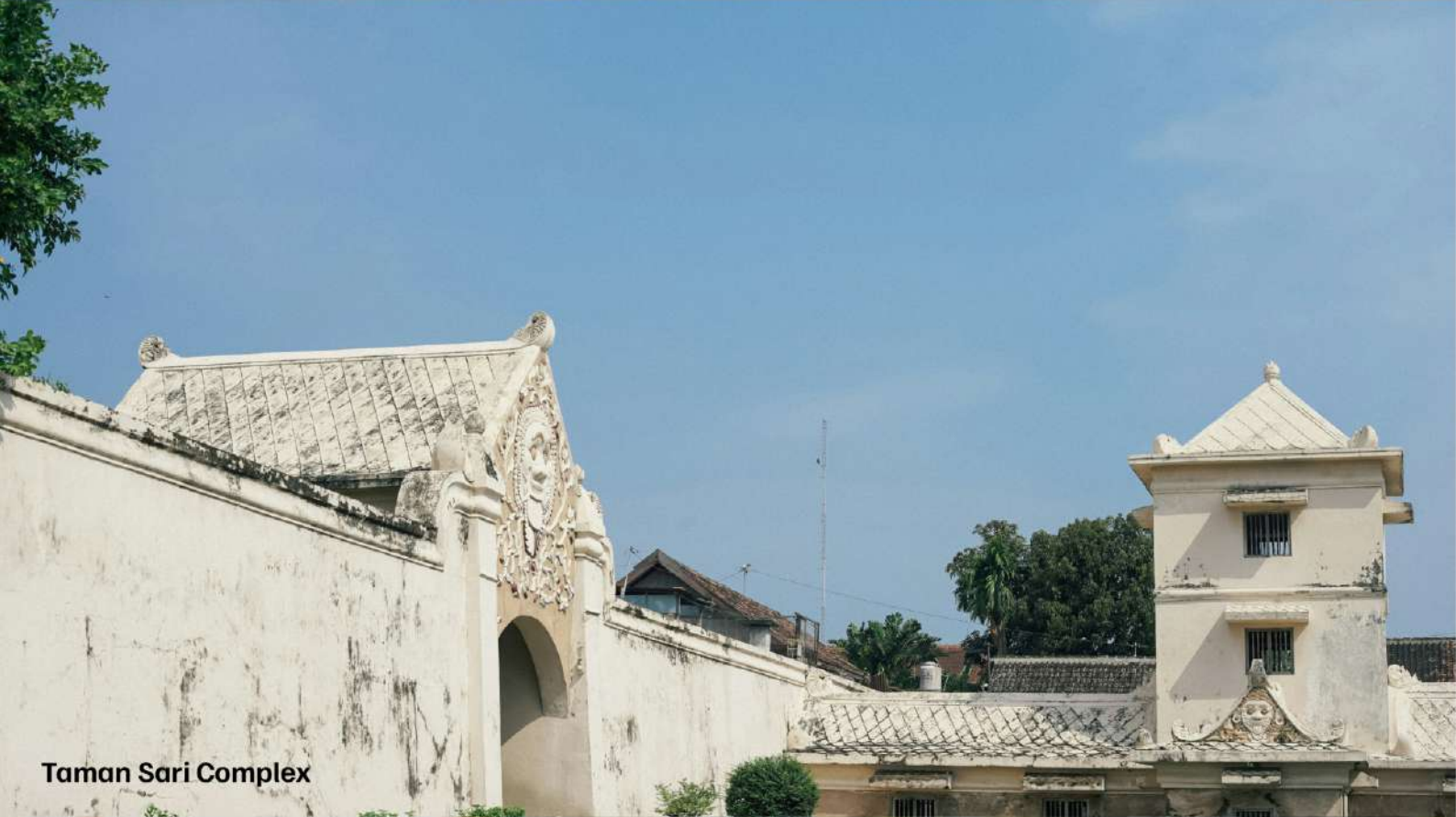
Taman Sari Complex